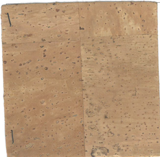
ART.103-TENCEL NATURAL H. 140 cm PU BACKING