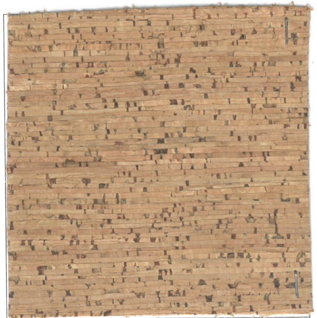
ART.49-TENCEL NATURAL H. 140 cm PU BACKING