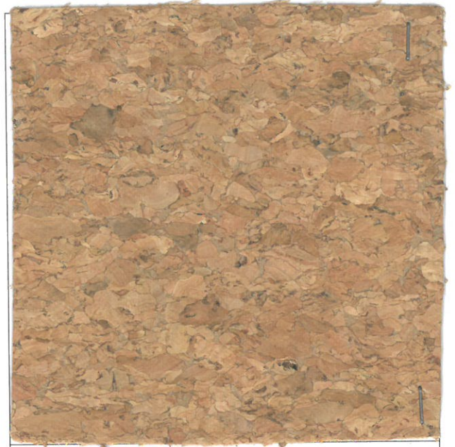
ART.104-TENCEL NATURAL H. 140 cm PU BACKING