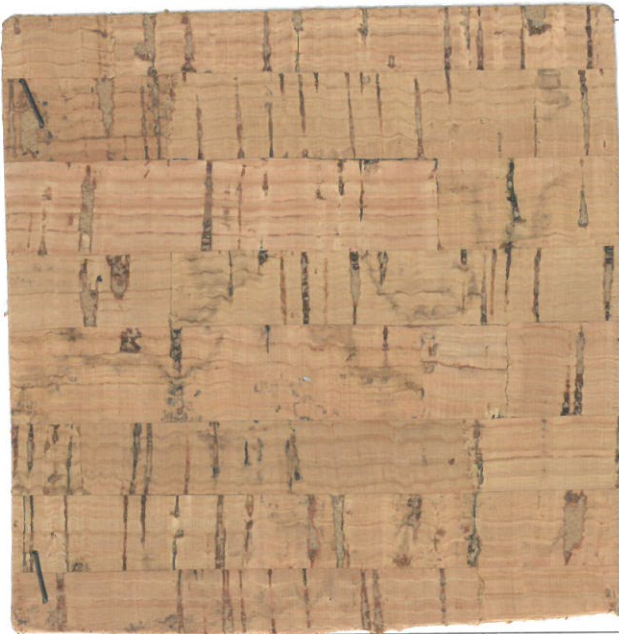
ART.105-TENCEL NATURAL H. 140 cm PU BACKING

The perfect symbiosis of Natural Cork and Cellulosic fibers of botanic origin fabric La perfetta simbiosi tra sughero naturale e fibre cellulosiche di origine vegetale